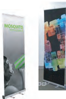
Retractable Banner Stand Can be used over and over. Easy set-up. Graphics included in price. 32" x 82" Includes Carrying Case $185.00