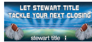
Our 2' x 6' booth horizontal banner can hang on the back of your booth. Single-sided with grommets for hanging. Banner material is heavy duty 13oz. Can be reused over and over. $95.00