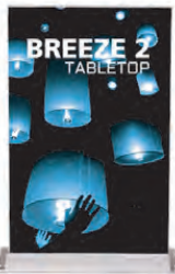
Retractable Mini table top Banner Stand Can be used over and over. Easy set-up. Graphics included in price. 11" x 17" $40.00

ALL CANCELLATIONS FOR ITEMS ORDERED MUST BE MADE 5 BUSINESS DAYS BEFORE THE EXHIBITOR MOVE IN DATE TO RECEIVE A FULL REFUND. ITEMS CANCELLED AFTER THE 3 BUSINESS DAYS BUT BEFORE THE EXHIBITOR MOVE IN DATE WILL BE SUBJECT TO A RESTOCKING FEE OF $25.00. ANY ITEMS DELIVERED TO THE SHOW SITE OR ITEMS REQUESTED TO BE REMOVED BY THE SHOW REPRESENTATIVE FOR ANY REASON WITHOUT PRIOR CANCELLATION WILL BE CHARGED AT FULL PRICE EVEN IF REFUSED AT BOOTH.