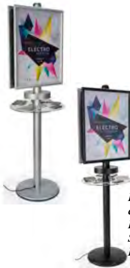
Double sided or single sided charging stations. RENTAL In black or silver. Single $180.00 Double $250.00