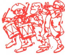
Exhibit Dates Updated!!!!