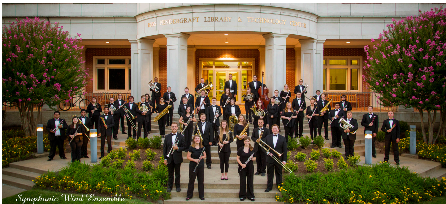
Symphonic Wind Ensemble